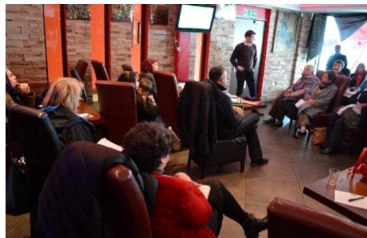
Initial Neighbourhood forum meeting taking place on Saturday, 16 March 2013 kindly hosted by Maya Restaurant

Sunday, 28 April 2013 from 12 o'clock (mid-day) to 5 pm Saturday, 25 May 2013 from 12 o'clock (mid-day) to 5 pm