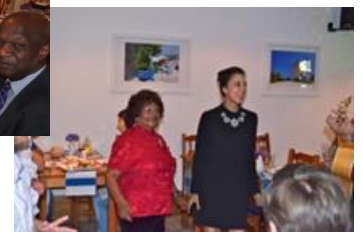
Members dancing the night away

Please print and pass on to your neighbour