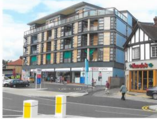
The "Prince of Wales" site, August 2008 - The "Prince of Wales" remained the only pub in this part of Kingsbury until J.J. Moors opened in Kingsbury Road in 1988. In the 1960's the hall at its side became the Bandwagon, a discotheque which also featured live music groups, and by the late 1970's this was notorious as "... the most famous heavy metal rock venue in the country." Complaints about the noise caused the Bandwagon to shut in 1981, and the pub itself closed in 2005, as its large site was worth more for development. In 2007 work began on a five storey block of forty-four flats, called "Azure", with a shop on the ground floor, which opened as a Tesco Express store on 21 August 2008.

... showing what had recently replaced it, and what newcomers to the area might never have known about.