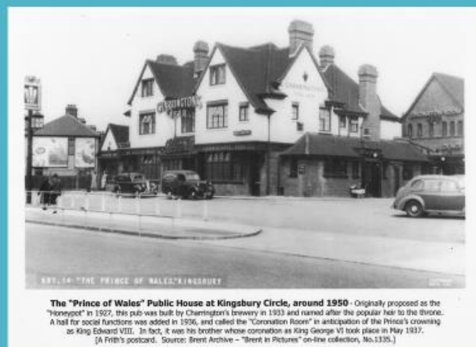
The “Prince of Wales” Public House at Kingsbury Circle, around 1950 - Originally proposed as the “Honeycot” in 1927, this pub was built by Charrington’s brewery in 1933 and named after the popular heir to the throne. A hall for social functions was added in 1936, and called the “Coronation Room” in anticipation of the Prince’s crowning as King Edward VIII. In fact, it was his brother whose coronation as King George VI took place in May 1937. (A Frih’s postcard. Source: Brent Archive – “Brent in Pictures” on-line collection, No.1339.)